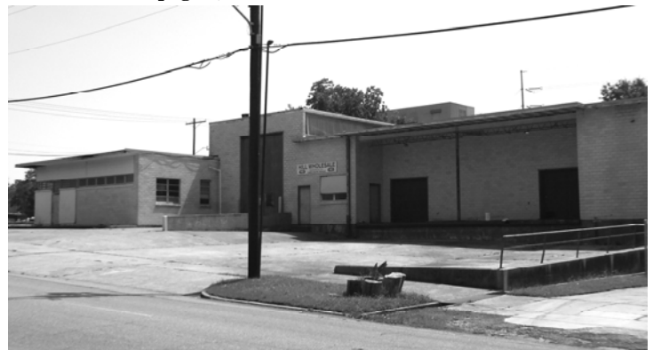
The "before" photo of our new Essential Needs Distribution Center. Currently, work is being done to put this building into operation before the end of November. See more details in the story below.

The tournament will be held on October 31 st at the Greystone Golf and Country Club in Denham Springs. We encourage you to consider sponsoring or playing in the tournament. You don't have to be a golfer to help; you can also support this effort by making a contribution. 100% of every contribution will go directly to the good work of St. Vincent de Paul, so please consider supporting this event. Join Price LeBlanc and these outstanding community leaders in making a real difference. See the registration form on page 2 or go online to register at www.svdpbr.org . Continued on page 2; see "Price LeBlanc Golf Tournament"