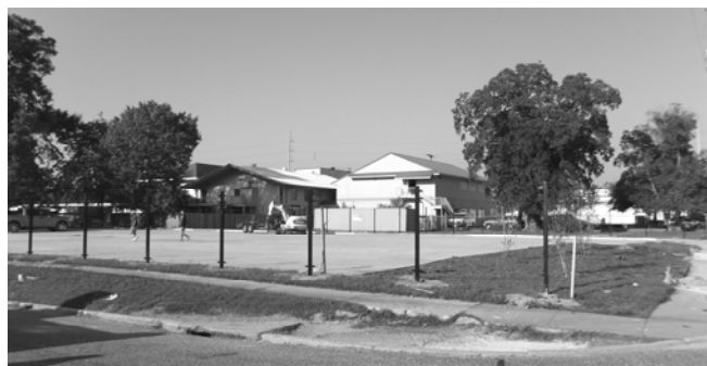
Florida Blvd. property acquisition expands St. Vincent de Paul charitable campus. See details in the story below.

Because the One-Stop is strategically located right across the street from the St. Vincent de Paul campus where so many services are offered, this site is the perfect location. St. Vincent de Paul looks forward to working together with the Capital Area Alliance for the Homeless and all the other homeless providers in our community to make a difference in the lives of homeless men, women and children.