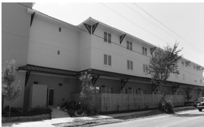
The new One-Stop Center for the Homeless is ready for opening. This new collaborative effort will help so many homeless individuals.

Ensure that your values and beliefs live forever by remembering the Society of St. Vincent de Paul in your will.